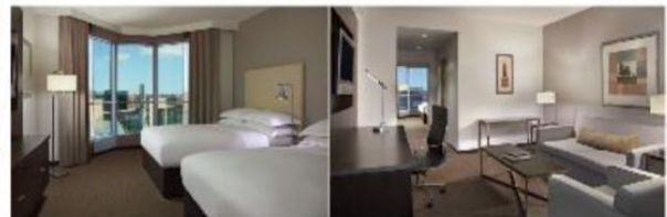
Standard Suite Double Bedroom and Living Room

8500 Warden Avenue Markham, ON L6G 1A5 905-470-8500 www.torontomarkham.hilton.com