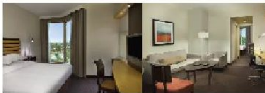
Standard Suite King Bedroom and Living Room